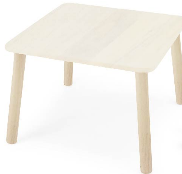
P8005 SQUARE TABLE W 60 x L 60 x H 43 cm W 23½ x L 23½ x H 17 in