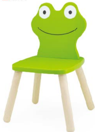
P8000 FROG CHAIR W 33 x L 31 x H 54 cm W 13 x L 12¼ x H 21¼ in Seat Height: 26.5 cm Seat Height: 10½ in