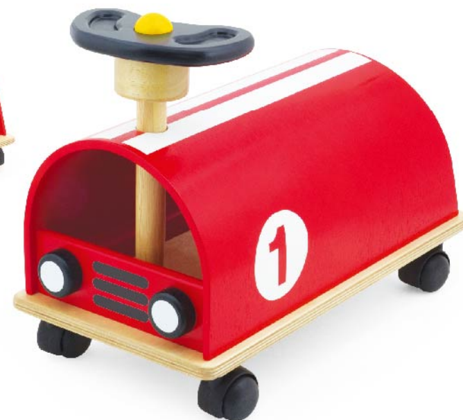
P0004 PT MY RED RACE CAR

W 22 x L 42 x H 31 cm W 8¾ x L 16½ x H 12¼ in