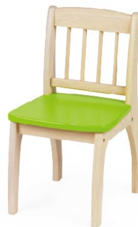
P8007 JUNIOR CHAIR W 32 x L 35.5 x H 60 cm W 12½ x L 14 x H 23½ in Seat Height: 32 cm Seat Height: 12½ in