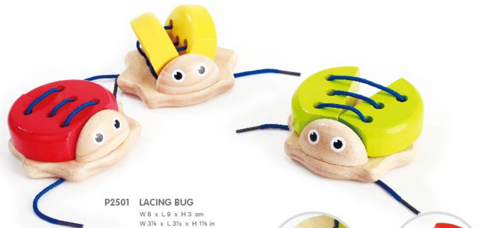
P2501 LACING BUG

W 8 x L 9 x H 3 cm W 3¼ x L 3½ x H 1¼ in 9 pc/box In 3 Assorted Colours Box Size: W 26 x L 26 x H 3.5 cm