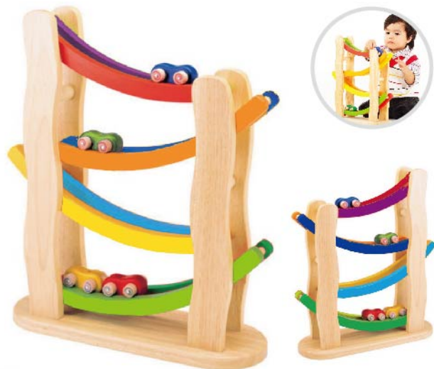
P0506 RAINBOW SLOPE™ W 12 x L 35.5 x H 41 cm W 4¾ x L 14 x H 16¼ in >12m