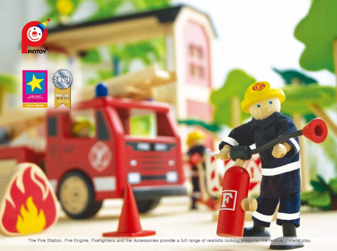
The Fire Station, Fire Engine, Firefighters and the Accessories provide a full range of realistic looking props for fire rescue pretend play.