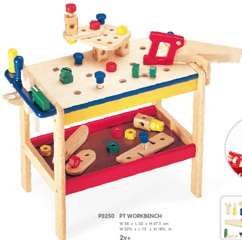
P3250 PT WORKBENCH W 58 x L 33 x H 47.5 cm W 22½ x L 13 x H 18¾ in 2y+