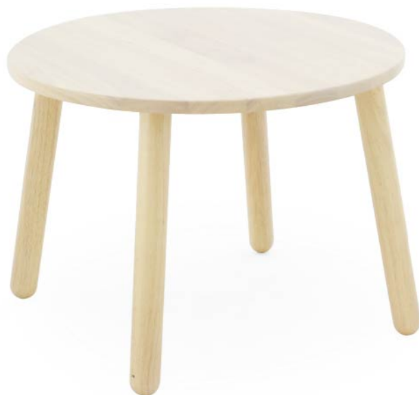
P8004 ROUND TABLE DIA 60 x H 43.5 cm DIA 23½ x H 17¼ in