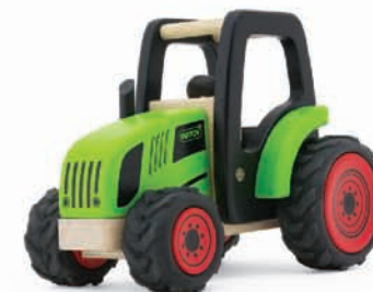
P3150 PT TRACTOR W 12 x L 18 x H 14 cm W 4 3/4 x L 7 1/8 x H 5 1/2 in 3y+