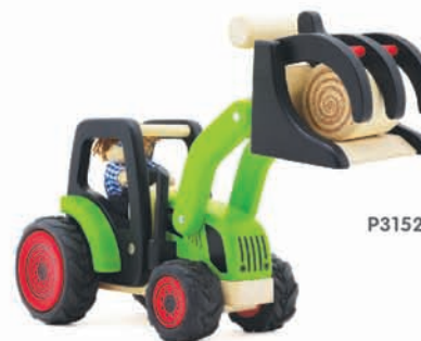
P3152 PT HAY LOADER W 12 x L 29 x H 14 cm W 4 3/4 x L 11 3/8 x H 5 1/2 in 3y+