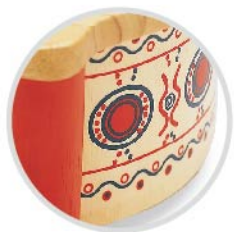
P0702 DRUM W 19 x L 19.5 x H 9.5 cm W 7½ x L 7½ x H 3¾ in 12m+