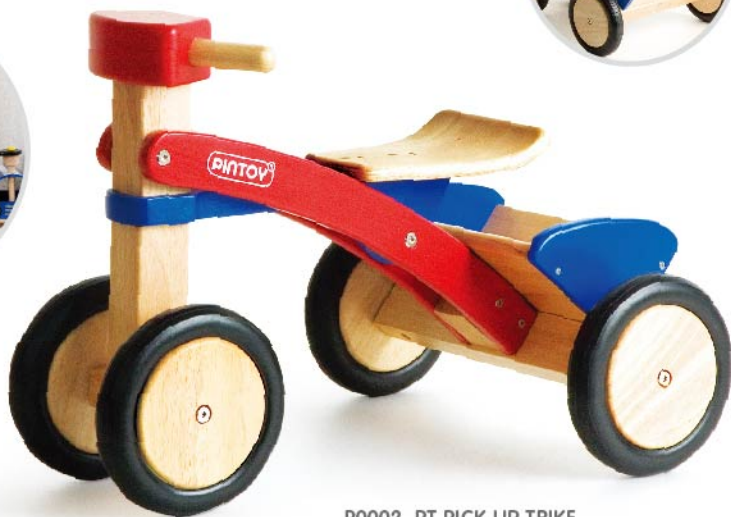
P0002 PT PICK UP TRIKE

W 36 x L 50 x H 36 cm W 14¼ x L 19¾ x H 14¼ in