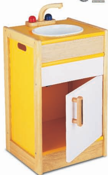
P3303 SINK W 40 x D 35 x H 78.5 cm W 15½ x D 13¾ x H 31 in 3y+