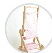
P3203 PT DOLL'S STROLLER W 38 x L 50 x H 50 cm W 15 x L 19¾ x H 19¾ in 3y+