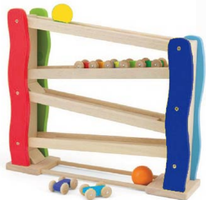
P0508 SUPER SLOPE W 44 x L 10.5 x H 37.5 cm W 17¾ x L 4¼ x H 14¾ in >18m