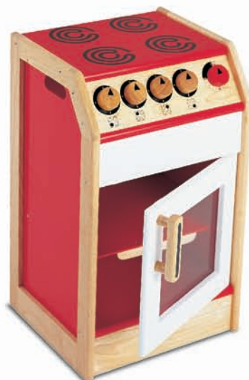
P3302 COOKER/STOVE W 40 x D 35 x H 66 cm W 15½ x D 13¾ x H 26 in 3y+