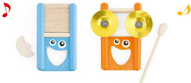
P0701 MULTI SOUND SET Each Frame: W 10 x L 17 x T 2 cm Each Frame: W 3½ x L 6¼ x T ¾ in 2y+