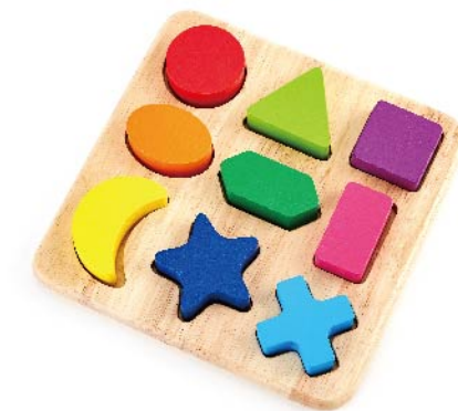
P0600 SHAPE MATCHING BOARD W 20 x L 20 x H 2.5 cm W 7¾ x L 7¾ x H 1 in >18m