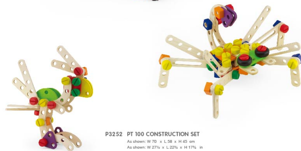
P3252 PT 100 CONSTRUCTION SET As shown: W 70 x L 58 x H 45 cm As shown: W 27½ x L 22¾ x H 17¾ in 3y+

With the 100 piece Construction Set, Kids can build anything from this big set and there are also lots of possible outcome as well. This toy is best in improving hand and eye coordination, fine motor development and it can also boost the creativity and imagination of the kids.