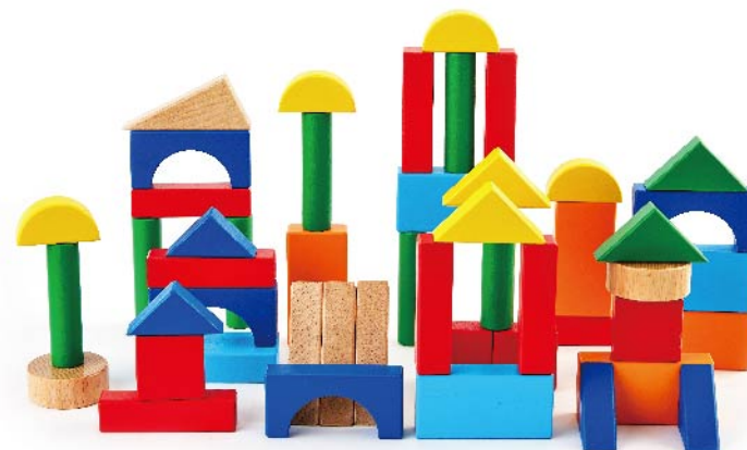
P0510 50 WOODEN BLOCKS Unit block: W 4 x L 8 x H 2 cm Unit block: W 1½ x L 3¼ x H ¾ in >12m