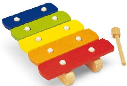
P0700 BASIC XYLOPHONE W 19 x L 26 x H 5 cm W 7½ x L 10¼ x H 2 in 12m+