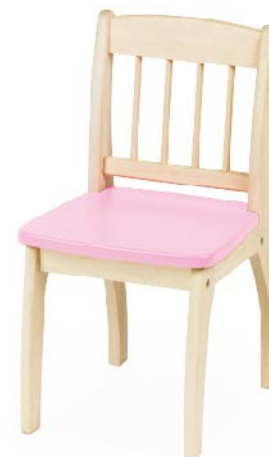
P8008 JUNIOR CHAIR W 32 x L 35.5 x H 60 cm W 12½ x L 14 x H 23½ in Seat Height: 32 cm Seat Height: 12½ in