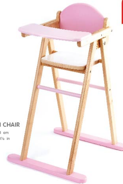
P3201 PT DOLL'S HIGH CHAIR W 36 x L 40.5 x H 60 cm W 14¼ x L 16 x H 23½ in 3y+