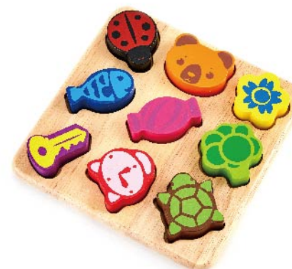
P0601 FORM BOARD W 20 x L 20 x H 2.5 cm W 7¾ x L 7¾ x H 1 in >18m