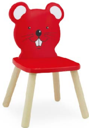
P8003 MOUSE CHAIR W 33 x L 31 x H 54 cm W 13 x L 12¼ x H 21¼ in Seat Height: 26.5 cm Seat Height: 10½ in