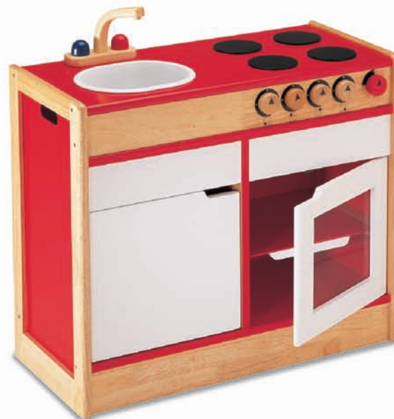
P3305 SINK AND STOVE W 78 x D 35 x H 78 cm W 30¾ x D 13¾ x H 31 in 3y+