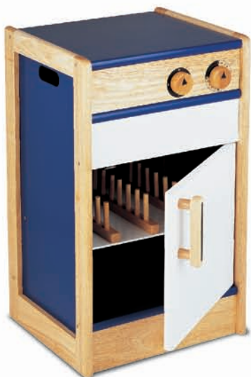
P3300 DISHWASHER W 40 x D 35 x H 66 cm W 15½ x D 13¾ x H 26 in 3y+