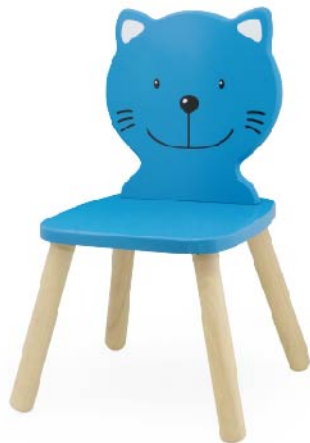
P8002 CAT CHAIR W 33 x L 31 x H 54 cm W 13 x L 12¼ x H 21¼ in Seat Height: 26.5 cm Seat Height: 10½ in