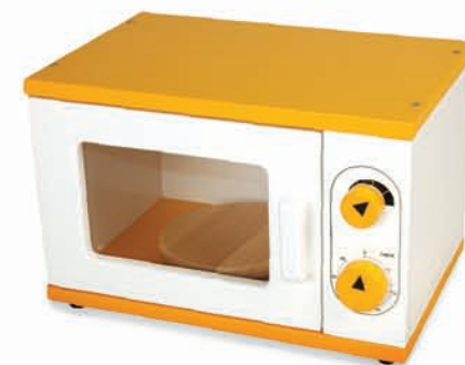
P3304 MICROWAVE W 38 x D 27.5 x H 25 cm W 15 x D 10¾ x H 9¾ in 3y+