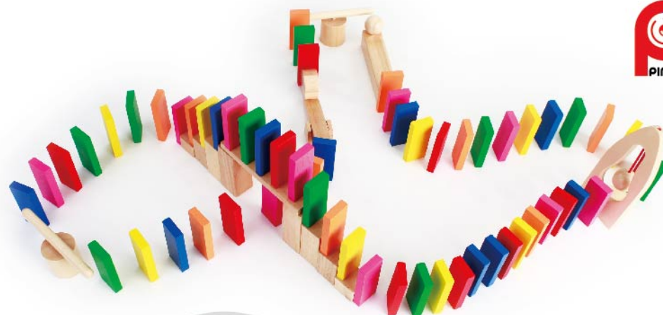
P2500 TUMBLING DOMINOES

Size of Domino Blocks: W 3 x L 7 x T 1 cm Size of Domino Blocks: W 1¼ x L 2¾ x T ¾ in • 60 Domino Blocks : • 15 Red • 15 Blue • 15 Orange • 15 Green • 1 Pendulum Start Gate • 1 Rolling Slope with Ball • 1 Seesaw with Roller • 2 Turn-arounds • 1 Bridge with 8 steps