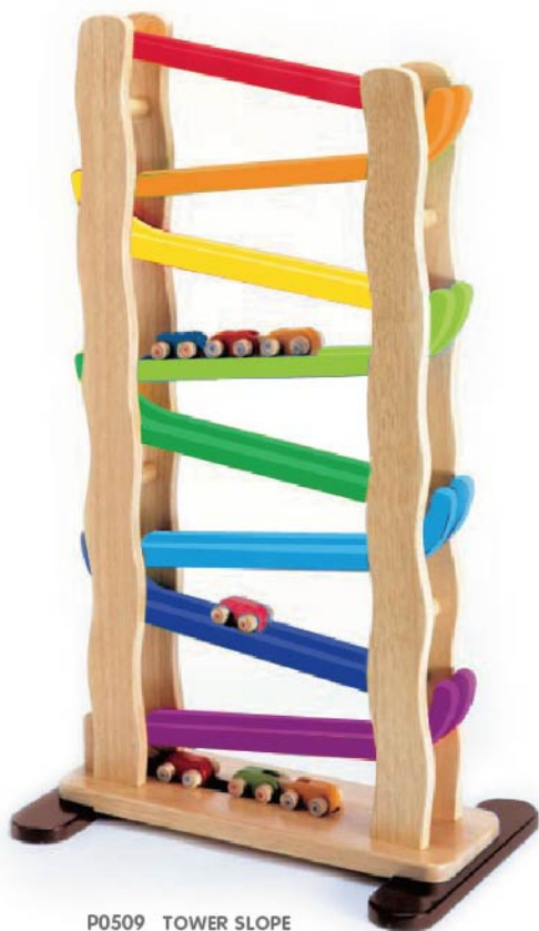
P0509 TOWER SLOPE W 32 x L 44 x H 77 cm W 12½ x L 17¾ x H 30¾ in 2y+