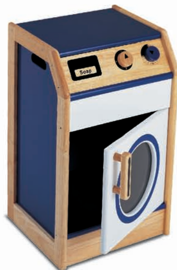
P3301 WASHING MACHINE W 40 x D 35 x H 66 cm W 15½ x D 13¾ x H 26 in 3y+