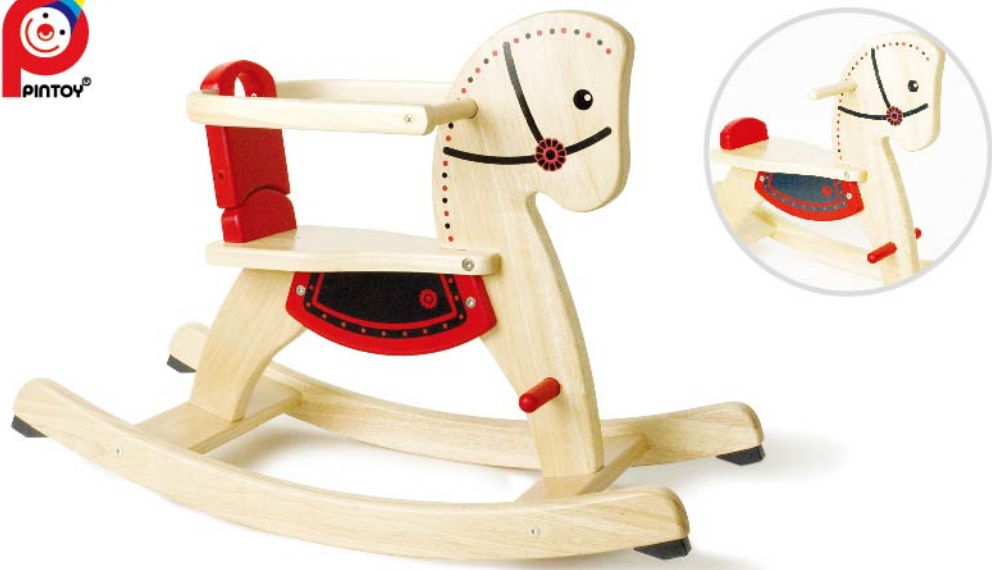
P0001 PT SHETLAND ROCKING HORSE

W 30 x L 73 x H 52 cm W 11¼ x L 28¾ x H 20½ in