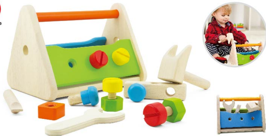
P3251 PT TOOL BOX W 18.5 x L 25 x H 18 cm W 7½ x L 9¾ x H 14¼ in 2y+