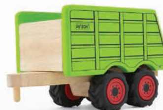
P3151 PT HOPPER TRAILER W 10.5 x L 23 x H 13 cm W 4 1/8 x L 9 x H 5 1/8 in 3y+