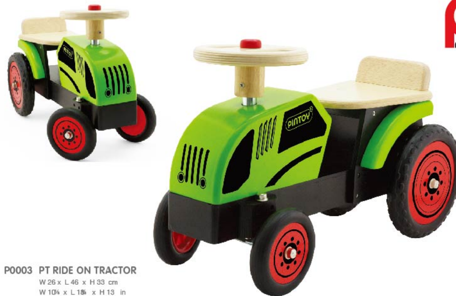
P0003 PT RIDE ON TRACTOR

W 26 x L 46 x H 33 cm W 10¼ x L 18¼ x H 13 in