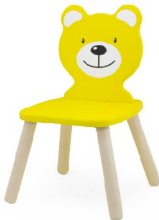
P8001 BEAR CHAIR W 33 x L 31 x H 54 cm W 13 x L 12¼ x H 21¼ in Seat Height: 26.5 cm Seat Height: 10½ in