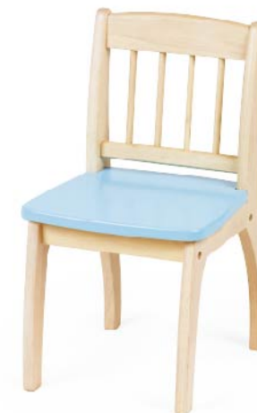
P8009 JUNIOR CHAIR W 32 x L 35.5 x H 60 cm W 12½ x L 14 x H 23½ in Seat Height: 32 cm Seat Height: 12½ in