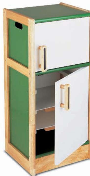
P3306 REFRIGERATOR W 40 x D 35 x H 87 cm W 15½ x D 13¾ x H 34¼ in 3y+