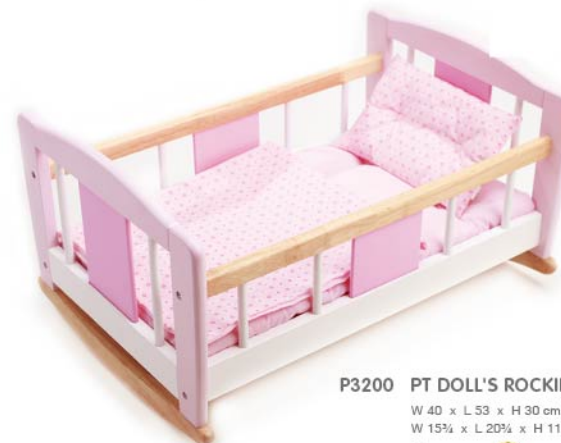
P3200 PT DOLL'S ROCKING CRADLE W 40 x L 53 x H 30 cm W 15½ x L 20½ x H 11¾ in 3y+