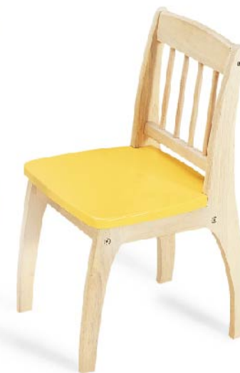
P8006 JUNIOR CHAIR W 32 x L 35.5 x H 60 cm W 12½ x L 14 x H 23½ in Seat Height: 32 cm Seat Height: 12½ in