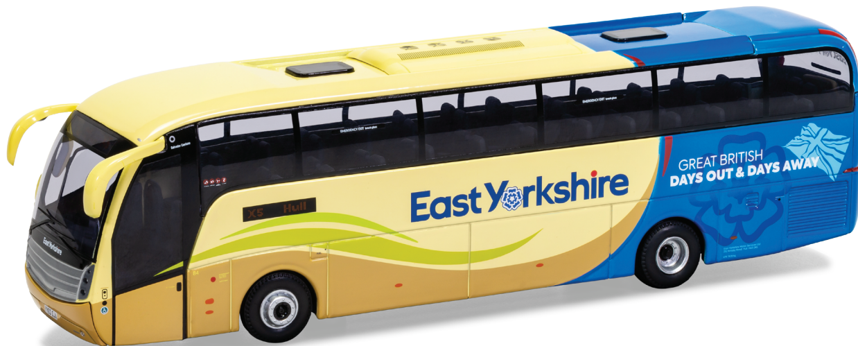
OM46411 Caetano Levante East Yorkshire, YY63OJA, Route X5, Hull NEW | Length 165mm | Limited Edition

New to East Yorkshire Motor Services in January 2014, YY63 OJA No.84 was part of the National Express franchise, and was liveried with that branding. It now spends most of it's time on the X5 Route to Hull, as well as rail replacement duty in Cleethorpes.